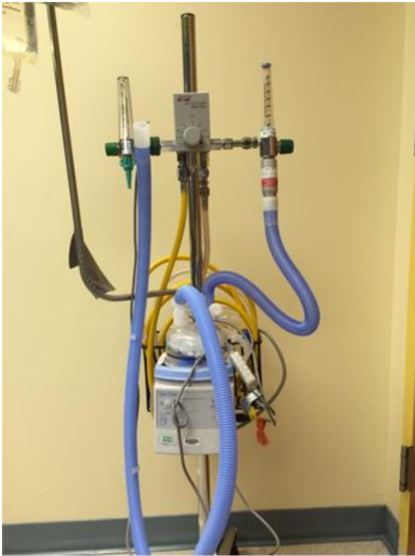
High Flow Nasal Cannula