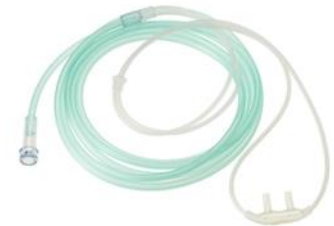
Standard Nasal Cannula