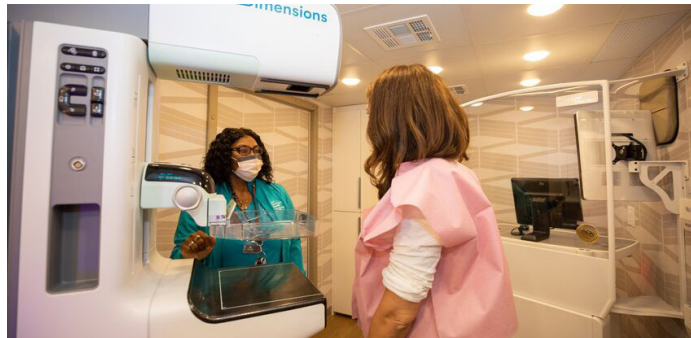
3-D Mammography and Breast Ultrasound Van

A new screening 3-D Mammography and Breast Ultrasound Van rolled out, bringing world-class breast imaging expertise to women in the local community.