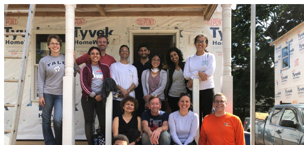
Physicians and other volunteers at a Habitat for Humanity build

Through Habitat for Humanity , medical residents helped community members build strong foundations. While in-person participation was limited, physicians funded a grant to support additional Habitat builds.