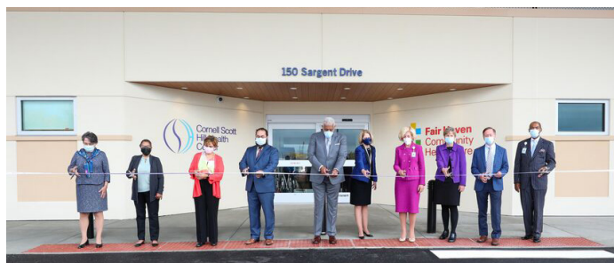
Leaders cut the ribbon on the new community Primary Care Center

YNHH, along with Fair Haven Community Health Care and Cornell Scott Hill Health Center, coordinated the opening of a new “one-stop shop” primary care hub on Long Wharf in New Haven.