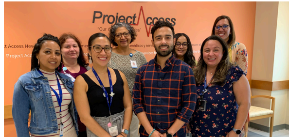
Project Access New Haven staff

Project Access helps people who face multiple barriers receive the medical care they need.