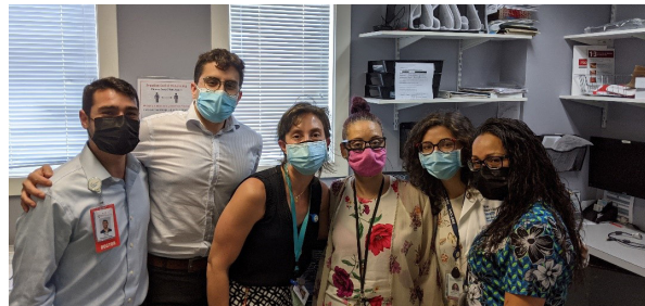
Diabetes Health Equity clinic staff

Food as Health provides assistance, tools to help people manage diabetes.