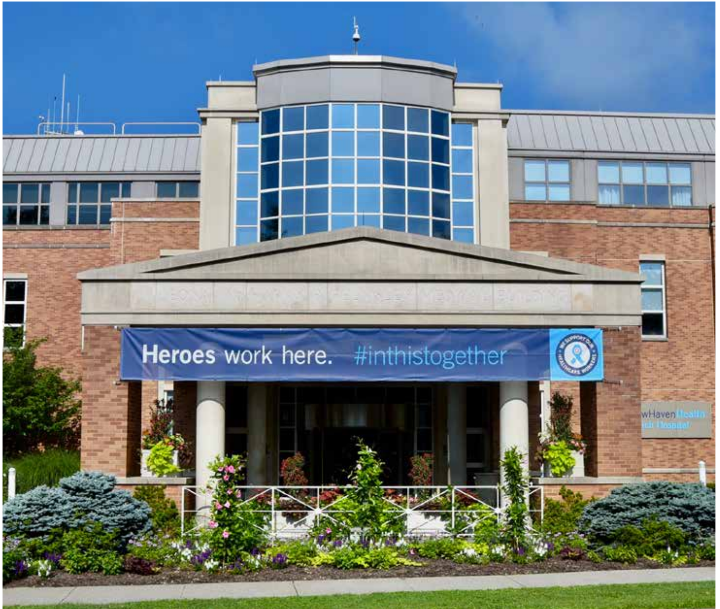
Greenwich Hospital is grateful to thousands of healthcare workers who rose to the challenge to care for COVID-19 patients.