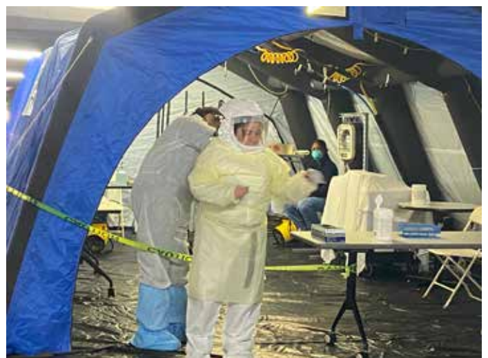
Greenwich Hospital was the first hospital in Connecticut to establish a drive-through COVID-19 testing site.