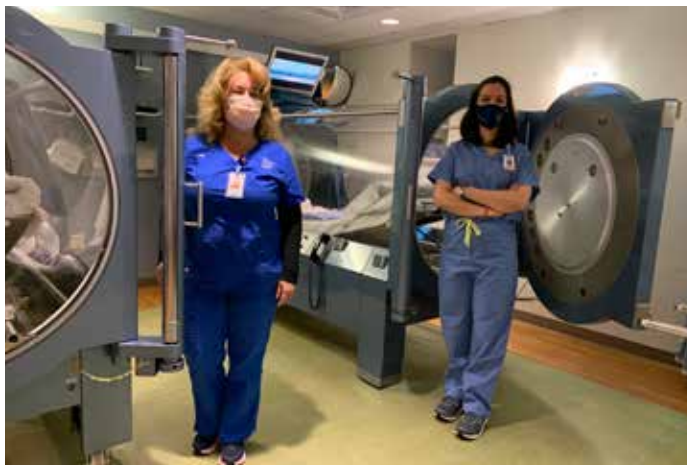
At Greenwich Hospital, hyperbaric medicine is often used to treat difficult-to-heal wounds that have not responded to traditional treatments and to COVID-19 patients during the pandemic.

Technology and video conference platforms proved valuable in continuity of patient care, especially during the pandemic. Patients and providers used MyChart video visits via Zoom video conference to conduct office visits virtually. Among other benefits, the move to Zoom allowed patients to grant access to adult children who don't live locally or otherwise can't join them for the appointment.