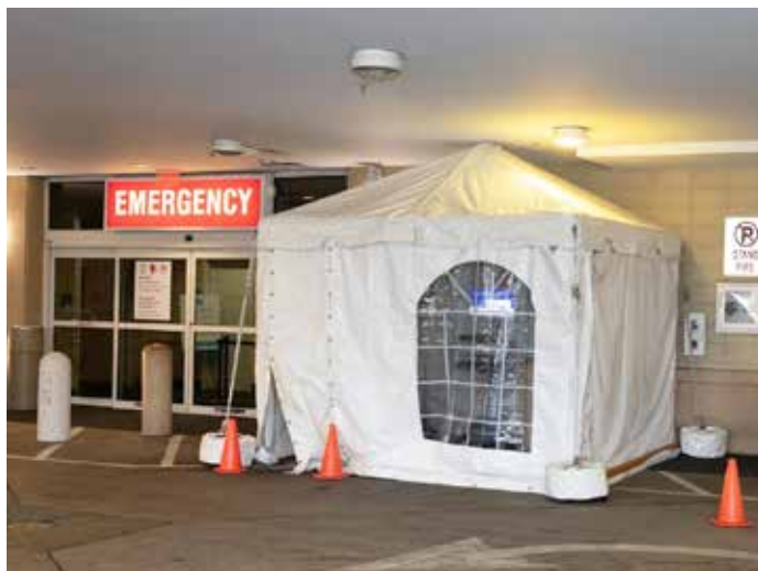
A tent on the Emergency Department deck was used to triage patients during the height of the pandemic to ensure safety.

The outpouring of support from the community was heartwarming. They donated 17,000 meals along with supplies, personal protection equipment, as well as $3.3 million to a variety of COVID-19 programs. Parades of first responders paid their respects to frontline employees. Residents sent messages of encouragement and posted thank you notes on doors, sidewalks and on social media. Although Greenwich Hospital suspended volunteer programs, the Auxiliary supported staff from afar by making masks and donating food. An anonymous couple made a generous gift to establish a dedicated, state-of-the-art unit for patients with infectious diseases, including COVID-19, and purchase powered air-purifying respirator suits to protect frontline staff.