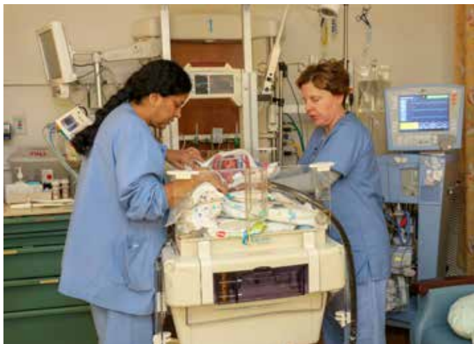
Greenwich Hospital's Neonatal Intensive Care Unit cares for premature and ill newborns.

Thousands of residents from Connecticut and New York relied on Greenwich Hospital for their health care in 2020. Inpatient discharges reached 12,737 for the year, with outpatient encounters at 253,779. The number of births, 2,814, increased over last year's total. The Emergency Department saw 32,534 visits.