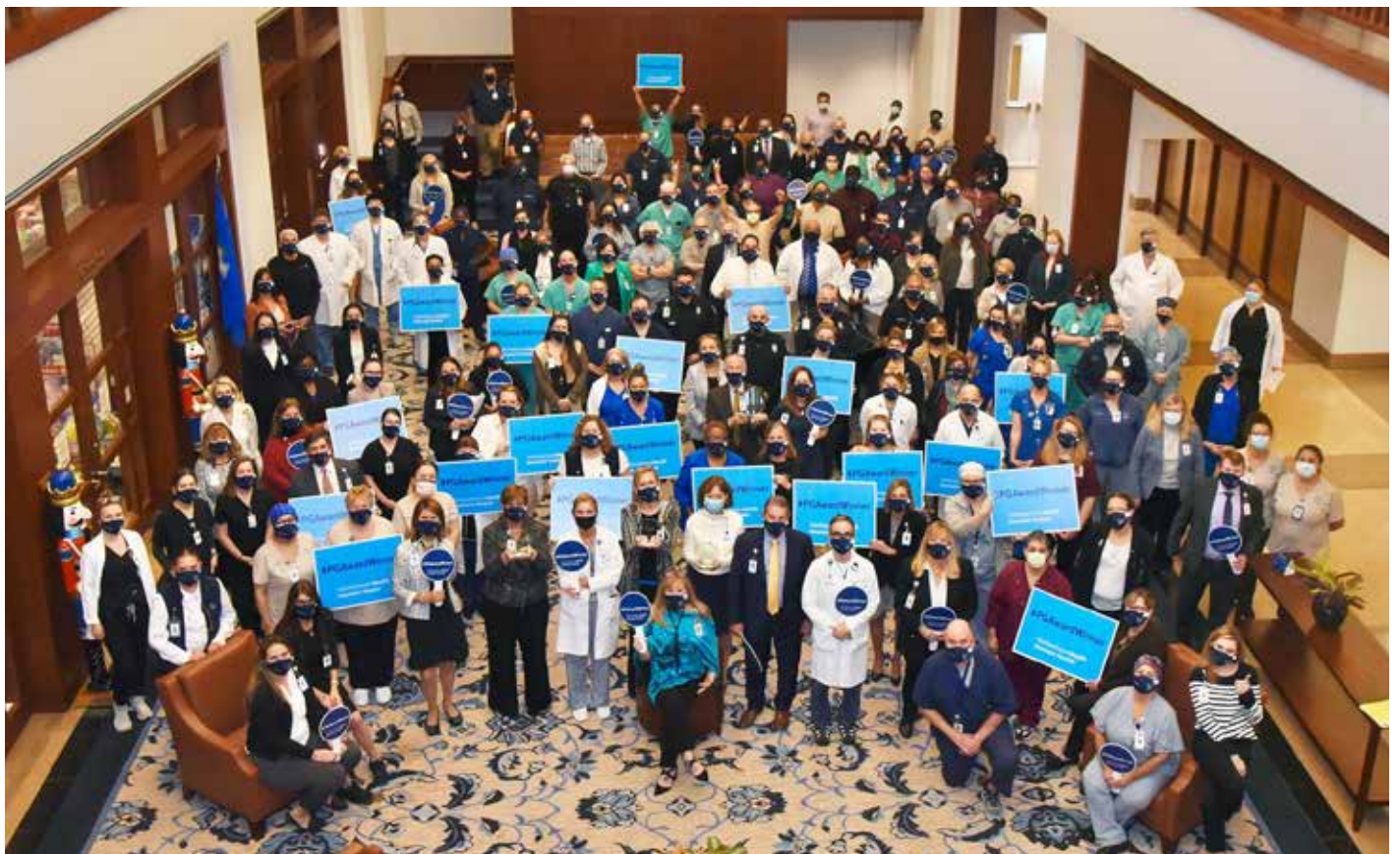
Greenwich Hospital's commitment to high-quality care and the patient experience garnered seven national recognitions.

In addition, the Greenwich Hospital Auxiliary met its financial commitment of $250,000 to support telestroke and pediatric services. It also funded four annual scholarships for high school graduates pursuing healthcare careers.