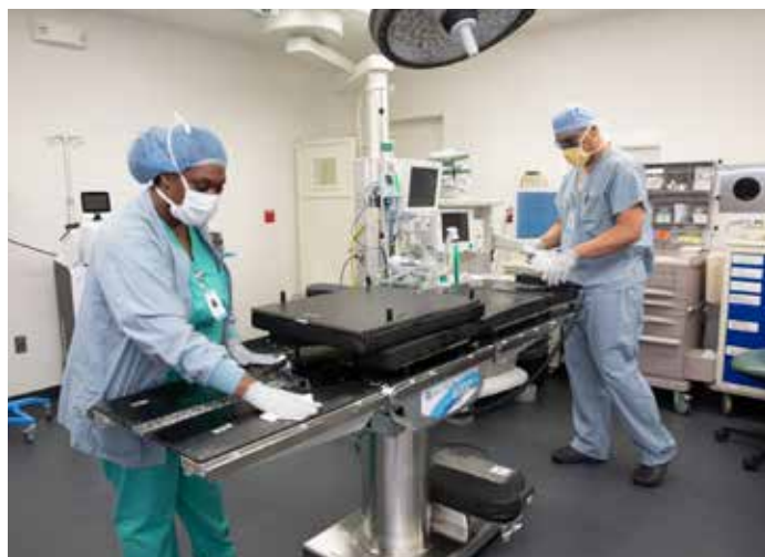
Greenwich Hospital resumed previously suspended clinical services, including elective surgeries, in May 2020. Staff meticulously followed safety protocols, including advanced cleaning and disinfecting in all areas.

By May, Greenwich Hospital began to resume clinical services that were suspended when the pandemic began. The hospital instituted numerous measures to protect staff, patients and visitors, including social distancing, additional COVID-19 screening and testing, and advanced cleaning and disinfection protocols.