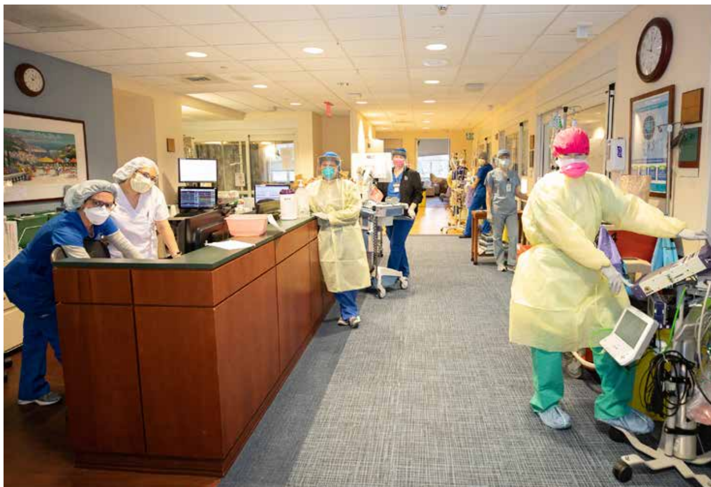
Nurses, physicians, respiratory therapists and others cared for COVID-19 patients in the Intensive Care Unit, which was expanded from 10 to 30 beds.

While the number of COVID-19 hospitalizations decreased during the summer, Greenwich Hospital prepared for an anticipated second wave, knowing its healthcare workers – now known as healthcare heroes – were poised to take on the challenge.