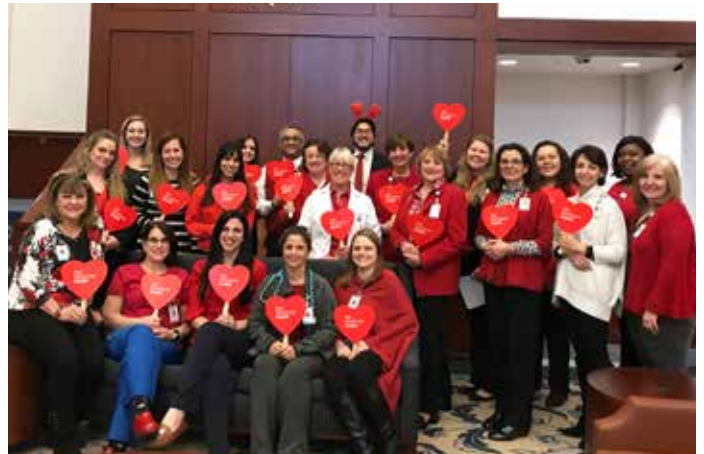
In this pre-pandemic photograph, hospital employees gathered on National Wear Red Day in February to raise awareness about heart disease among women.