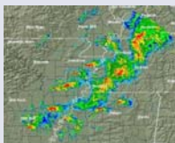
Arkansas storms

On May 14, 2008, FEMA reported that restoring business is an important part of Arkansas' recovery from recent severe storms, tornadoes and flooding. Businesses that plan for disaster before it strikes