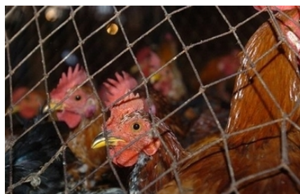
Bangladesh's first Infection hits

According to the World Health Organization (WHO), the cumulative number of confirmed cases of avian influenza H5N1 as of May 28, 2008, is 383 cases and 241 deaths.