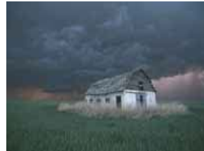
Tornado deaths reach 110 in 2008

On May 29, 2008, CNN reported that a tornado which touched down Sunday night in Parkersburg, Illinois, has claimed the lives of four people, with two additional deaths in the neighboring town of New Hartford. The victims are among at least 110 people killed in the US by tornadoes this year, putting 2008 on track to be one of the deadliest years in recent history. This year's death toll is already the highest since 1998, with seven months left in the year. To learn more about the incremental increase of tornadoes in the US, please visit http://www.cnn.com/2008/TECH/science/05/28/tornado.year/index.html .