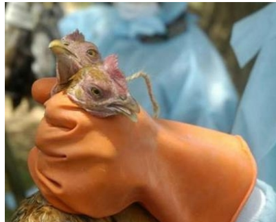
Indonesian Bird Flu

According to the World Health Organization (WHO), the cumulative number of confirmed cases of avian influenza H5N1 as of April 30, 2008, is 382 cases and 241 deaths.