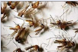
West Nile Virus

A State of Emergency was declared in California in August due to the high number of cases being reported of West Nile Virus (WNV.) California currently leads the nation this year in reported human cases of WNV with 172 as of August 31, 2007. (Wyoming has the