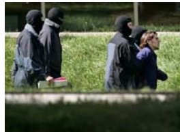
German Terror Plot

After more than six months surveillance, on September 4, 2007, German police arrested 3 people who were said to be in the final stages of assembling bombs in preparation for carrying out terrorist attacks. The same day, Danish authorities said eight militants with links to a known terrorist group were arrested. To read this article in full, please visit http://hosted.ap.org/dynamic/stories/G/GERMANY_TERROR?SITE=AP&SECTION=HOME&TEMPLATE=DEFAULT&CTIME=2007-09-06-09-43-45 .