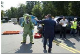
Connecticut Anthrax Scare

Connecticut officials confirmed on September 5, 2007 that 1 people in the city of Danbury contracted anthrax from animal skins brought from Africa for the purpose of making drums. It appeared that both had the cutaneous form of anthrax that is not contagious and can usually be treated with antibiotics. Further investigations revealed anthrax spores on the property also believed to be from the animal skins. To read this article in full, please visit