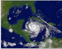
Hurricane Dean

The weather news of the past week shows us only too well how quickly a major hurricane can develop. Tropical Storm Dean quickly formed and grew to a massive category five storm prior to hitting Mexico. A different