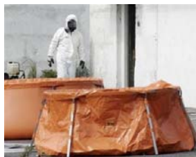
Bavaria, Germany

According to the World Health Organization (WHO), the cumulative number of confirmed cases of avian influenza H5N1 as of August 31, 2007 is 327 cases and 199 deaths.