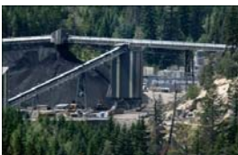
Crandall Canyon Coal Mine

On August 22, 2007, it was reported that the monsoon season in South Asia that began in June is causing widespread flooding that has led to 2700 deaths across India, Bangladesh and Nepal and caused food shortage and disease outbreaks. Waterborne diseases have sickened more than 300,000 people in India alone where people have rioted against insufficient government relief efforts. It is believed that over 20 million people have been affected by the flooding, with thousands of homes lost and millions of acres of cropland destroyed. To read this article in full, please visit http://coe-dmha.org/apdr/index.cfm?action=process3&Sub_ID=245&news=22907&pubDate=08/22/2007 .